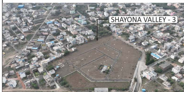
SHAYONA VALLEY - 3