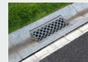
RCC Storm Drainage