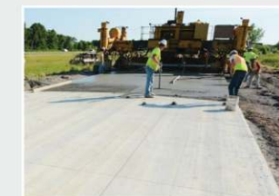
Cement Roads With Paver Blocks