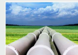
Water Sewage Line